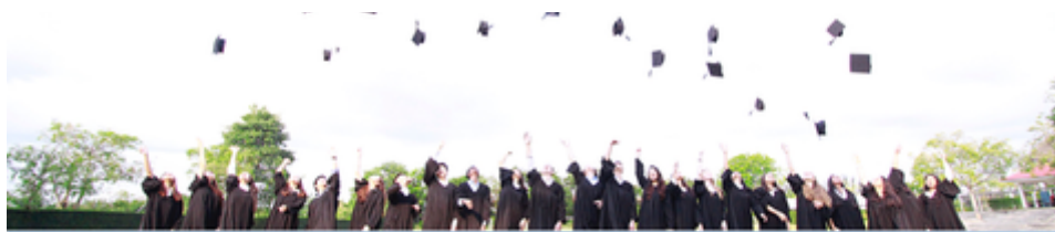
Garden International School, Eastern Seaboard, Ban Chang